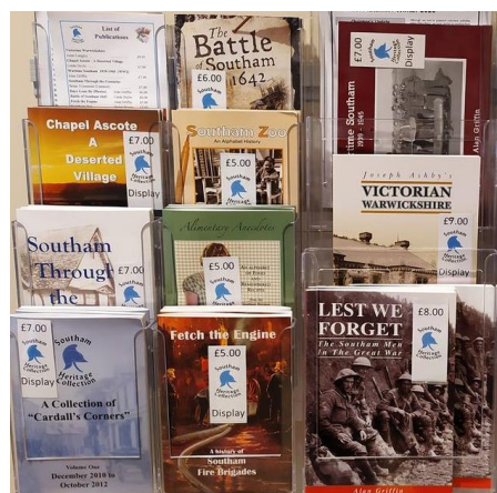
A few of our publications on Sale.