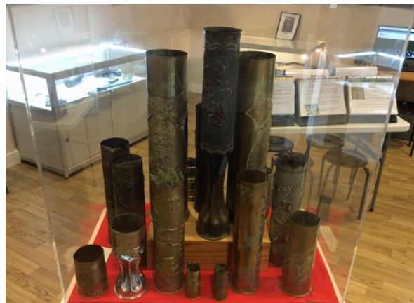
Trench Art display in the Exhibition Room

Much of Val's work is available on the Collection's web site and will remain available after this exhibition has closed. However, the current display also includes many items on loan to the Collection and these will be returned once the exhibition has closed. These include a fearsome rifle bayonet and a cigarette case damaged by a shell fragment but which saved the soldiers life.